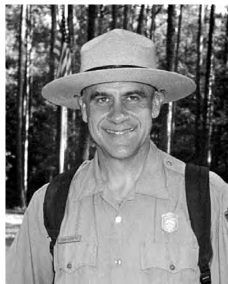
Rametta Family Photo