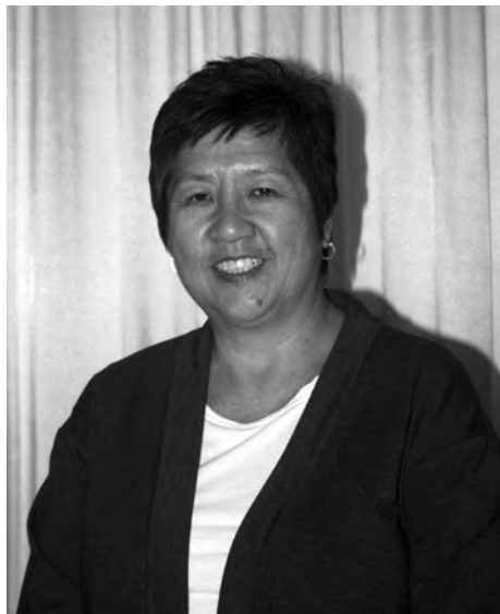
Family Photo by George Toye